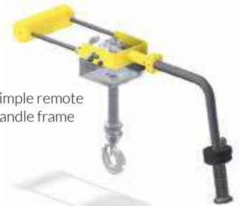
Simple remote handle frame