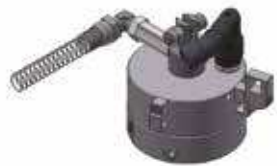
Air and electric connections via a continuous swivel joint at the toolhead to keep cables from tangling.