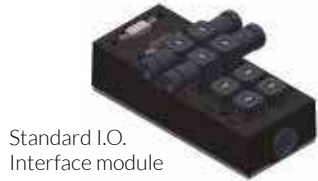
Standard I.O. Interface module