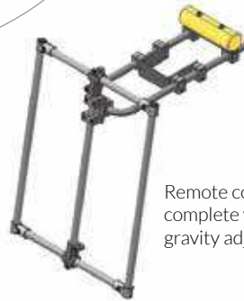
Remote control handles complete with centre of gravity adjustment