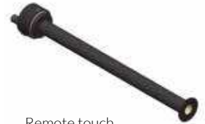
Remote touch sensitive handle available in different lengths