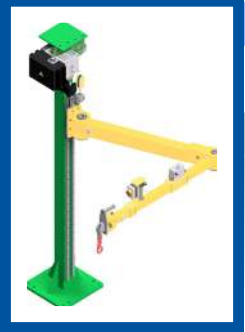
Size Light - standard with hook