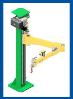
Size Heavy - standard with hook